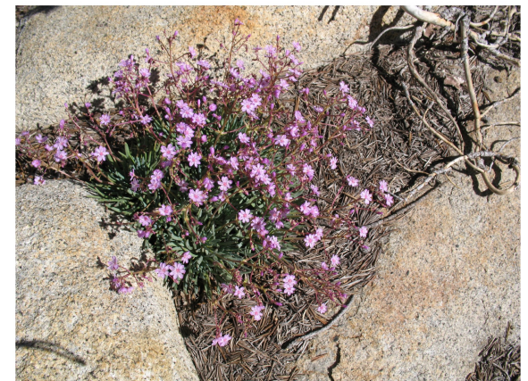
Lewisia leeana observed at el. 3,000m [9,840ft], w of Castle Peak, John Muir Wilderness, Sierra National Forest 25 June 2014