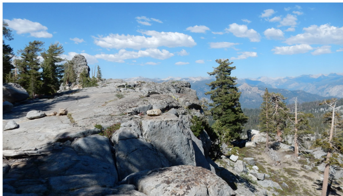
Typical habitat for Lewisia leeana , north of Spanish Mountain, John Muir Wilderness, el. 2,800m [9,200ft] 25 June 2015 http://www.inaturalist.org/observations/1721302