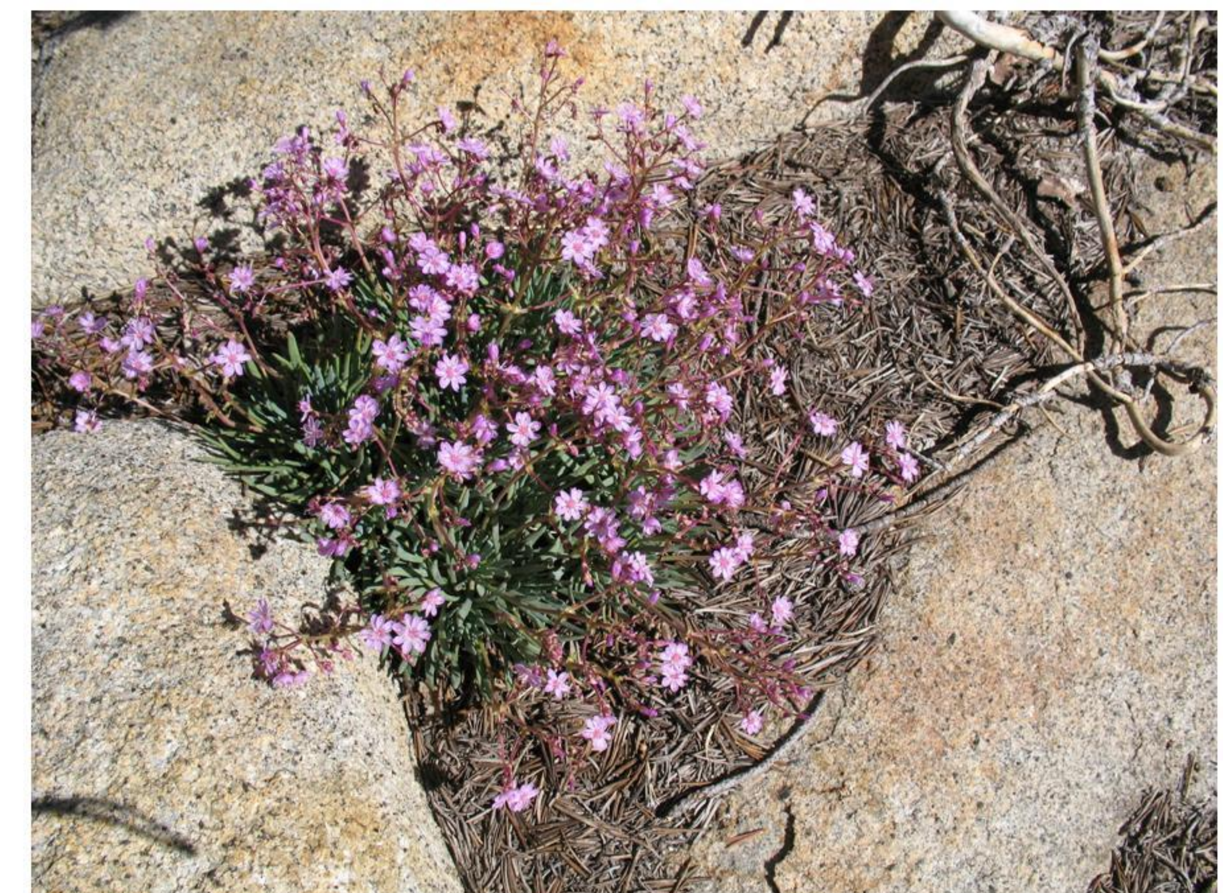
Lewisia leeana observed at el. 3,000m [9,840ft], w of Castle Peak, John Muir Wilderness, Sierra National Forest 25 June 2014