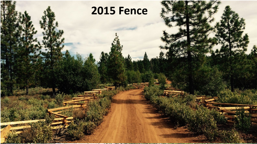
2017 baseline population plots established