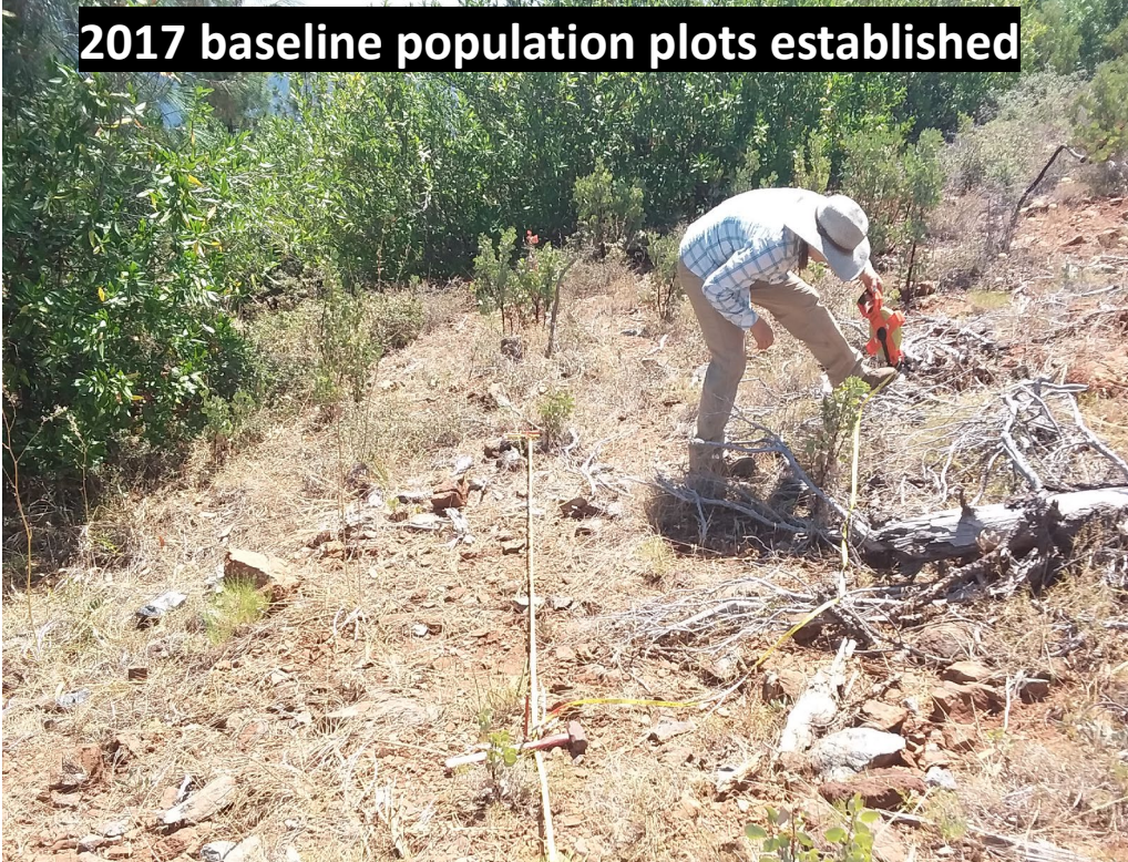
2017 baseline population plots established