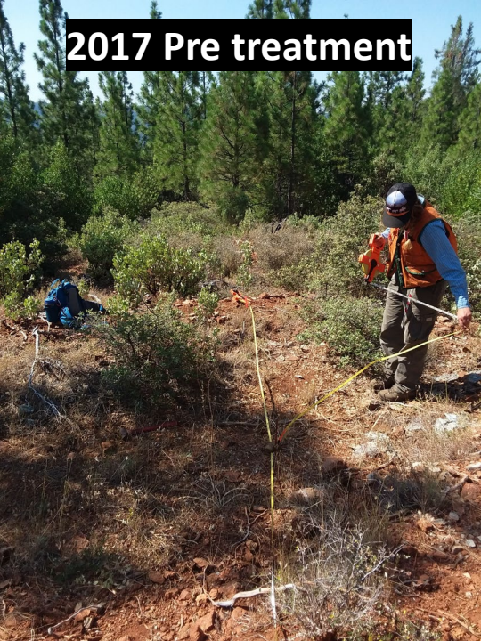
2017 Pre treatment